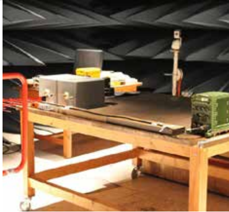
THE CM-ATR-3U PASSES ELECTROMAGNETIC EMISSION & RADIATION TEST. RADIATED E FIELD 30 MHz to 1 GHz HORIZONTAL POLARIZATION. MIL-STD-461F CERTIFICATE AVAILABLE.