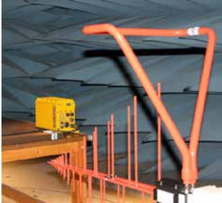
THE CM-ATR-3U PASSES ELECTROMAGNETIC EMISSION & RADIATION TEST. RADIATED E FIELD 30 MHz to 1 GHz VERTICAL POLARIZATION. MIL-STD-461F CERTIFICATE AVAILABLE.