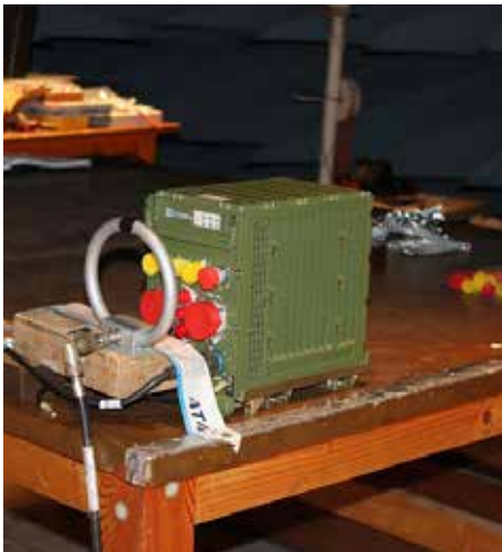
THE CM-ATR-3U PASSES ELECTROMAGNETIC RADIATED SUSCEPTIBILITY, MAGNETIC FIELD, 30HZ. MIL-STD-461F CERTIFICATE AVAILABLE.